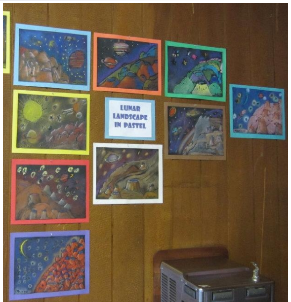
Above: Finished lunar landscapes using glue (for outlines) and chalk pastels. Below: Students are eager to try marbleized printing techniques to create galaxy swirls.