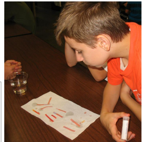
Below: A student experiments with pH paper to learn about acids and bases.