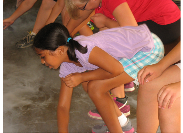
Above: Students feel LN2 vapor during a physics lesson on states of matter.

The camp will be featured during an upcoming episode of Outdoor Elements. We will partner with the park again for an astronomy based art camp in the summer of 2014.