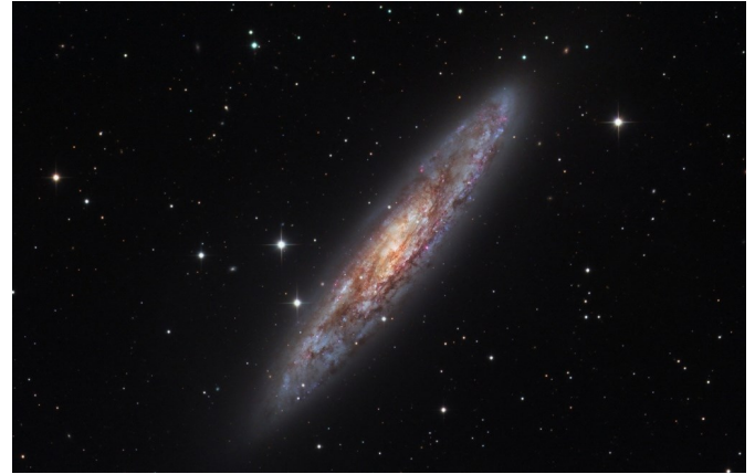
The Sculptor Galaxy NGC 253

We found that all of our models can equally well reproduce the observed abundances of the galaxy Sculptor (Fig. on the right), although they all point toward different concepts for how gas circulates inside and outside the galaxy. This implies that more constraints are needed to clarify which type of inflow and outflow models best describe the reality, other than stellar abundances. But most importantly, this work shows that GCE predictions are very sensitive to the choice of input stellar yields, which describe the output of stellar models and represent the mass of different elements ejected by stars as a function of their initial mass and chemical composition. In other words, the successes and failures of a GCE model will always be limited by its input yields. This study revealed that simple GCE models are sufficient to test stellar yields against observations and determine if stellar models produce enough or not enough of a particular element.