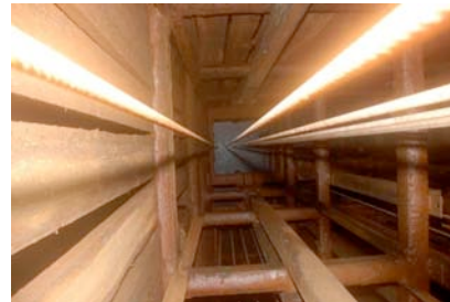
This view down Six Winze, a shaft that connects the 4550 Level to the 8000 Level at Homestake, shows the water level just below 4,600 feet underground.

Heavy spring snow and an unexpectedly high iron content in the mine water slowed dewatering in late spring and summer. The SDSTA installed clarifiers to remove the iron, and the water-treatment plant has been able to sustain pumping rates of 1,000 gallons per minute and more. As a result, the water level at Homestake was lowered to 4,600 feet underground by October 28—a milestone that made news throughout South Dakota. By November 5, the water had dropped to just below 4,611 feet underground. That was down from a high-water mark of 4,530 feet underground on August 21. The water level continues to drop, and plans are in the works to increase pumping and treatment capacity.