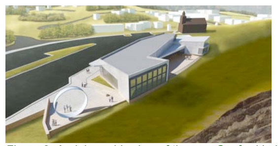
Figure 2: Aerial graphic view of the new Sanford Lab Homestake Visitor Center (Courtesy of Dangermond Keane Architecture)

Exhibits inside will set the context for the Lab, giving an overview of the history of the City of Lead and the Homestake mine, including the cultural context of the Native Americans as well as the various ethnicities of the miners who came to work at Homestake. The exhibits will also interpret the laboratory and the past, present and future science taking place, answering the question "why here?" Care will be taken to not duplicate the stories being told in the local Mining Museum and other local interpretive centers.