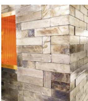
Figure 4: An intricate

MJD experimenters plan to begin collecting data this summer, although the shield will not be complete.