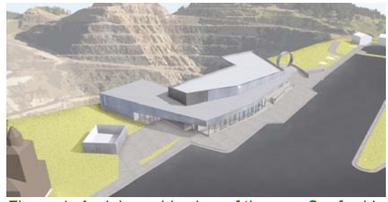
Figure 1: Aerial graphic view of the new Sanford Lab Homestake Visitor Center against the background of the Open Cut