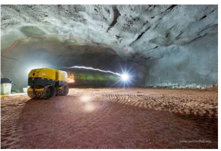
Figure 3: Transition Cavern of Davis Campus 4850 Level, seen here during outfitting, excavated in 2010. Now home to the MAJORANA DEMONSTRATOR experiment

The "Deep Photography" part of the exhibit chronicles the transformation of the Homestake Mine into the Sanford Underground Research Facility, and is part of the exhibit. Photography (examples shown in Figures 2 and 3) is by Steve Babbitt, professor of photography at BHSU, and Matt Kapust, SURF multimedia specialist.