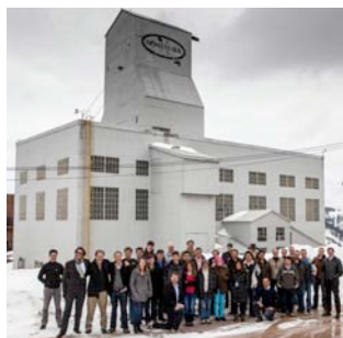
Figure 2: Members of the LUX collaboration at April 19-20 meeting in Lead