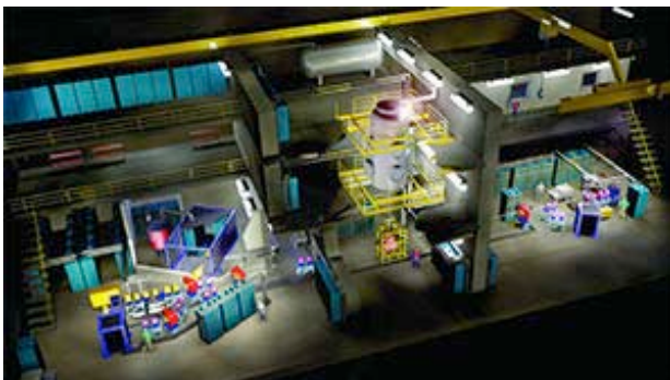
Figure 1: Graphic conception of DIANA facility as currently planned, consisting of two high-intensity, low-energy accelerators