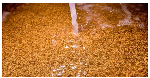
Figure 7: Flocculant is added to the iron-rich water pumped from underground

Previously, the process took place in the "green tank" inside the influent building. Noren indicated that they had problems with the line freezing every winter. Other issues included clearing out all of the iron from the flat tank, and the inability to bring back the water to the plant so it had to be processed and released by the city.