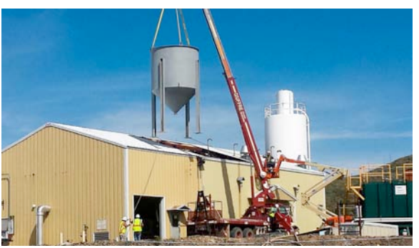
Figure 6: The new tank is lowered through the roof of the influent building

The Waste Water Treatment Plant (WWTP) recently received a new tank for processing waste water (see Figure 6). Since 2008, more than 4.5 billion gallons of water has been treated at Sanford Lab, over half of it coming from underground, and the rest from nearby Grizzly Gulch tailings. Once treated, the water is released into Gold Run Creek, which then joins Whitewood Creek.