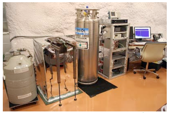
Figure 2: The recently installed BLBF HPGe spectrometer and associated equipment at SURF

Recently, ten samples were taken from the wall rock and concrete floor at the BLBF cavern to help determine the background radiogenic properties of the facility; they are now awaiting analysis (see Figure 3). Among the pieces collected is a sample of ironstone from a drift outside the cavern--Precambrian rock containing iron minerals. Another sample came from the rhyolite aggregate below sections of the concrete floor, which is usually higher in radiogenic background than the surrounding rock and concrete.