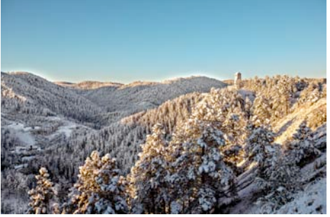
Figure 5: Panoramic morning view of summer snow at Sanford Lab

The first 22 piers of the Sanford Lab Homestake Visitor Center were completed on August 4. The piers, which run 90-100 feet belowground, will provide support for an 8000 square foot foundational slab (see Figure 4). Each pier takes a day to a day-and-a-half to install. Crews will then begin to pour the foundation. The goal is to have the structure enclosed before the snow season begins in South Dakota. (South Dakota already saw its first snowfall on September 11 – see Figure 5.) "We've got the right team working on this to make it happen," said Josh Willhite, SURF Engineering Director. Hopefully, the weather will cooperate with construction plans.