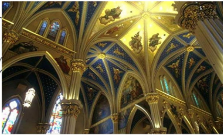
R-Matrix School at Notre Dame

The first school on the r-matrix @ ND (10/2004)