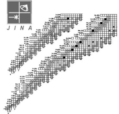
The second school on network reaction techniques @ ND (6/2005)

This work was supported by the Joint Institute for Nuclear Astrophysics under NSF Grant PHY0216783.