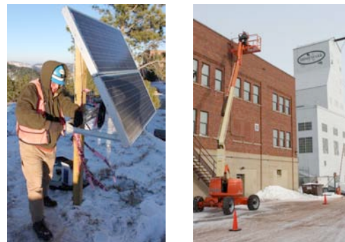
Figure 4: Left: Tom Regan assisting with installation of solar panel for surface seismic array station near Yates administration building; Right: Installation of wireless radio telemetry antenna for surface seismic stations at the Yates administration building

The full underground array is planned for complete operation by the end of February. The surface array