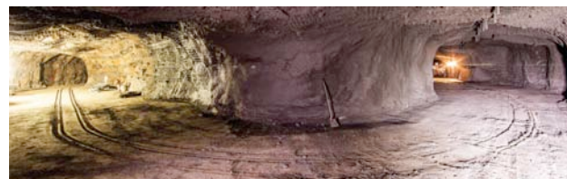
Figure 5: This cavern will house the CASPAR experiment. The left side has had shotcrete applied and will soon cover the ribs on the right.