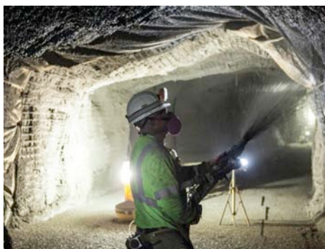
Figure 7: Wayne Sartorius, W-D Masonry sprays shotcrete on the wall

So far, more than 3,000 rock bolts and 550 sheets of welded mesh have been installed. In the CASPAR cavern alone, 360 bags of shotcrete, weighing 1500 pounds each, have been applied. By the time the underground campus is completed, shotcrete will cover approximately 19,000 square feet. The shotcrete is mixed underground in a batch plant near the Ross Shaft. Once mixed, it is blown onto the ribs (walls) and back (ceiling) of the caverns using a concrete pump and nozzle. Only 70 percent of the shotcrete adheres; the remainder, called rebound, hits the ground and is removed as waste. “We spend about three hours of every shift cleaning that up so it doesn’t adhere to the floors,” Pietzyk said.