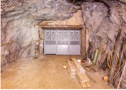
Figure 2: Installation of new ground support greatly improved safe access to SURF's underground 2000 Level

Improvements to underground access remained a major focus. The Yates Shaft team continued to make strong progress with their “top down” maintenance efforts while supporting science and facility operations. The Yates team advanced maintenance efforts to the 2600 level in the skip compartment and down 1500 feet in the cage compartment. In 2014, Ross Shaft crews refurbished 820 feet of shaft, including the installation of 49 new steel sets, and are now below the 2000 level—40 percent of the entire shaft length (shown in Figures 1-2).