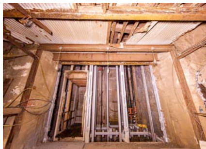
Figure 1: SURF underground: a “snow shed” on the 2000 Level Ross station was removed to promote safety

Facility space designs were completed for the Compact Accelerator System Performing Astrophysical Research (CASPAR) experiment and the Black Hills Underground Campus (BHUC). SDSTA crews completed the installation of ground support including rock bolts and mesh in 2014. In early 2015, a facility-outfitting contractor will transform these spaces into operational laboratories. These experiments are expected to be installed by mid-year.