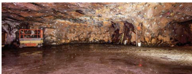
Figure 6: Rock bolting in the Black Hills Underground Campus has been completed