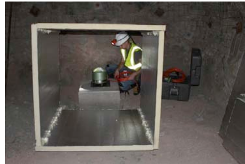
Figure 3: Tanner Prestegard installing DUGL seismic instrument at 4850 Level. The seismometer is the green object viewed through the insulation box in which it was ultimately housed. Part of the data logger is shown at the back under the orange cables.

of a typical surface instrument. Five of the full 25 instruments are currently operating (three in the underground and two at the surface). The remainder will be installed starting in January when the equipment arrives from IRIS. The data from the array are being recorded in real-time time by a data logging computer at the Sanford Lab administration building. Underground stations are using fiber optics connections for data communications and to transmit timing signals to individual data loggers. Surface sites use a GPS system for timing and six of the nine sites will use spread spectrum radios for data communication to the central recording site. The master radio for the surface sites has been installed on the Yates administration building (Figure 4, right), but the surface communication system is not currently functional due to interference from wireless networking equipment.